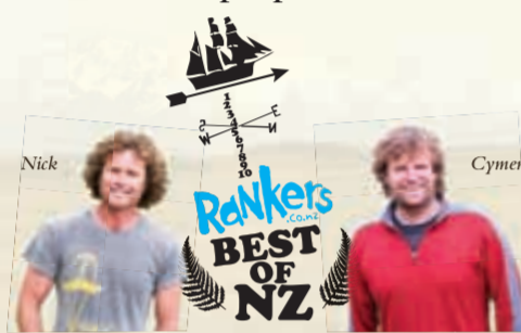
Cover Photo: Seek and ye shall find, Island, Auckland Region >

(3) Rankers.co.nz is owned by two local lads called Nick and Cymen. They set up Rankers so travellers can easily find the folk who look after people best.